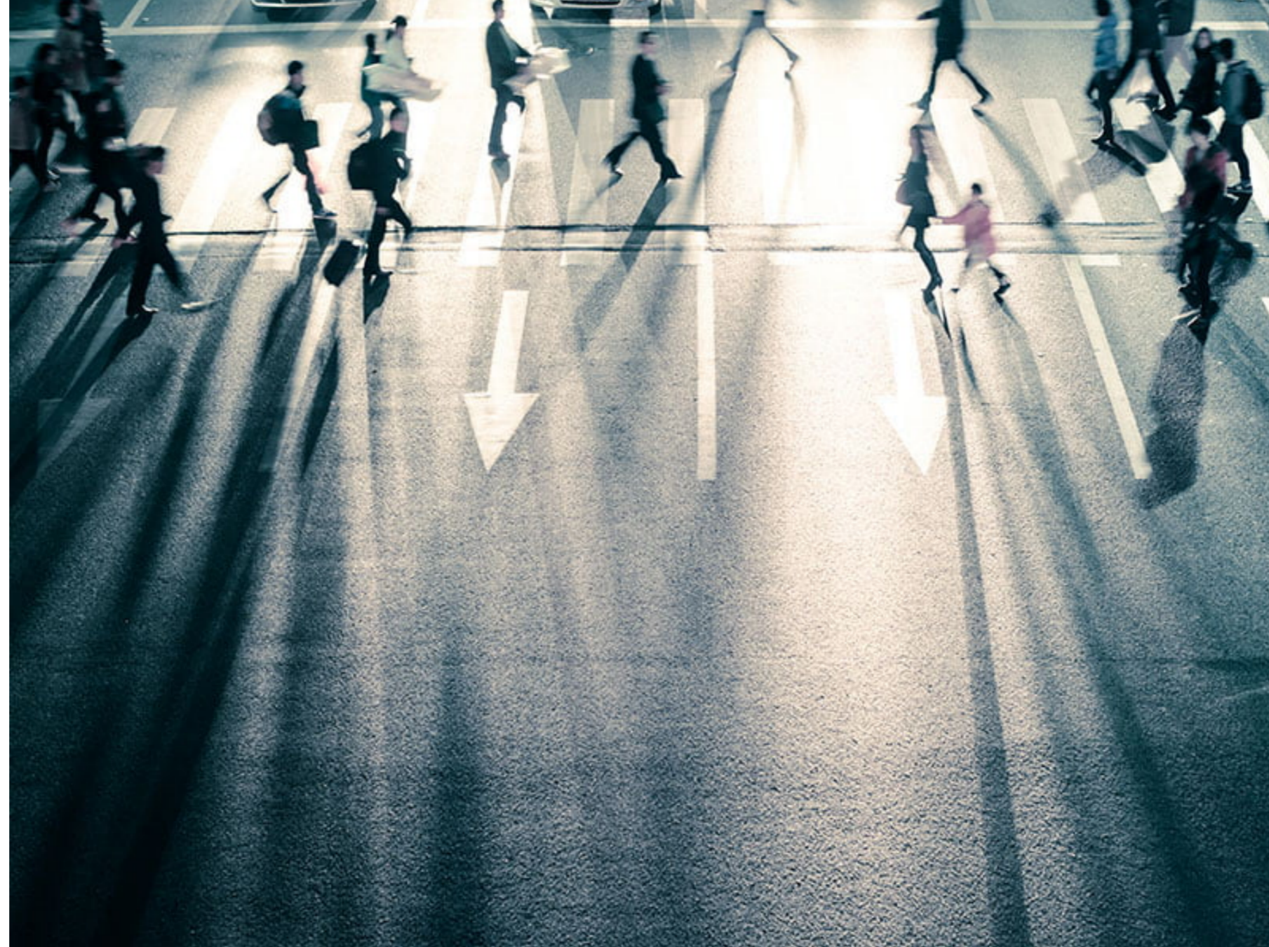
People: The AMA has concerns about sharing of health data

The app provides a version of what is currently available to NDIS participants through the web browser on smart phones, including viewing budgets, current plan timelines and to make and manage claims.